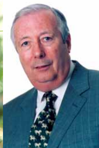
LORD HARRIS OF PECKHAM

We aim to build on this success with the support and sponsorship of Lord Harris of Peckham. We have recently invested over £10 million in improving our facilities making our already highly successful Academy even better.